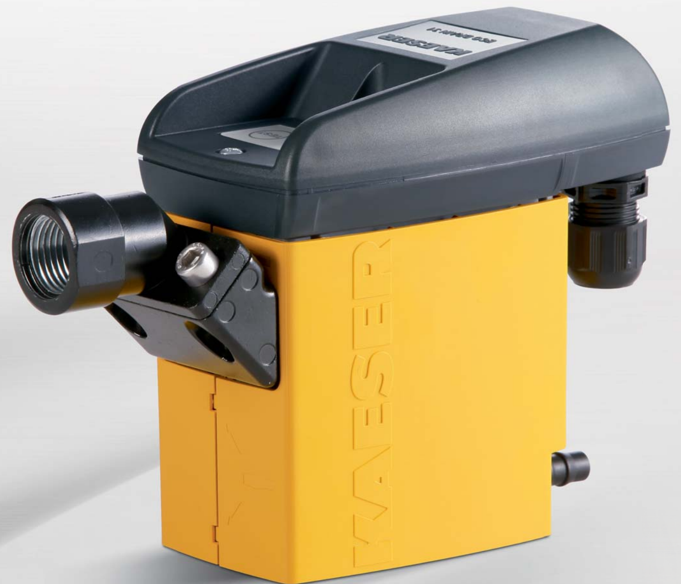
Image: ECO-DRAIN 31