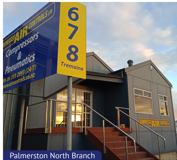
Palmerston North Branch