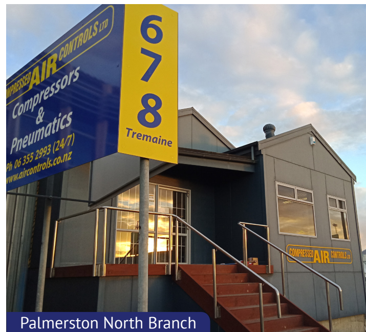
Palmerston North Branch